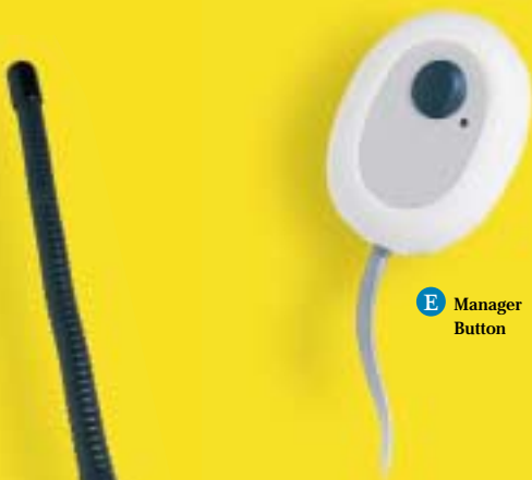
E Manager Button

SP-10 Staff Page System comes complete with mounting kit and magnetic name tags.