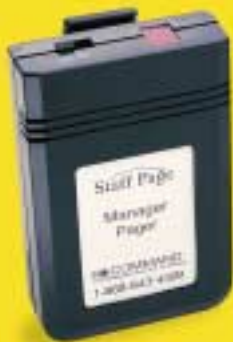
B Manager Pager