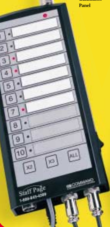
C Chef Transmitter Panel